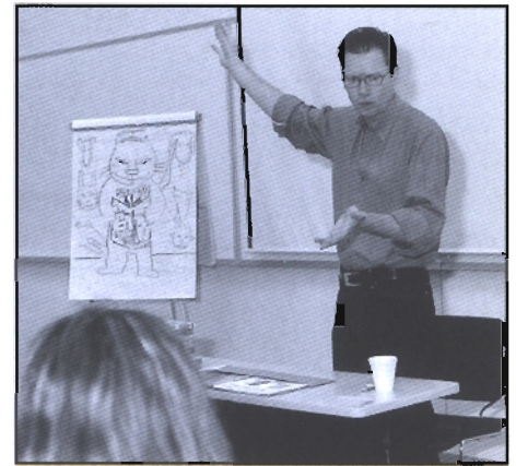
Newbery Honor winner Jack Gantos lecturing to students in a summer course.